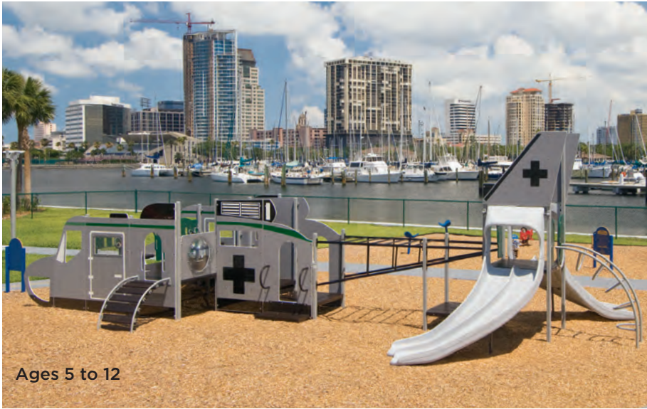
Ages 5 to 12