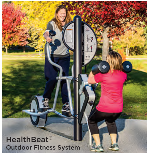
HealthBeat® Outdoor Fitness System