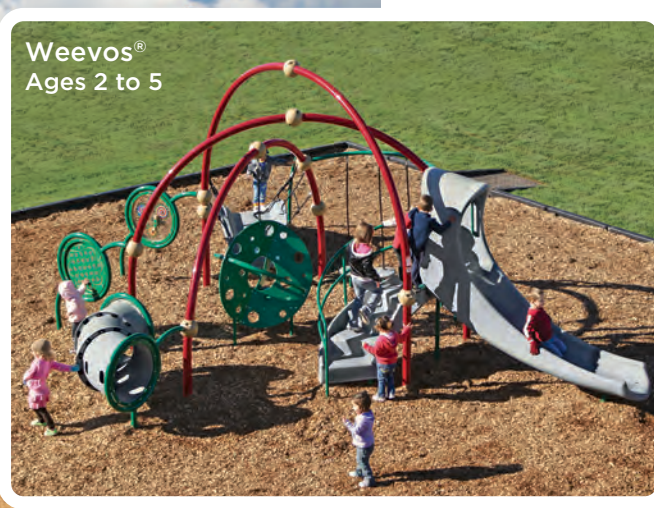
Weevos® Ages 2 to 5