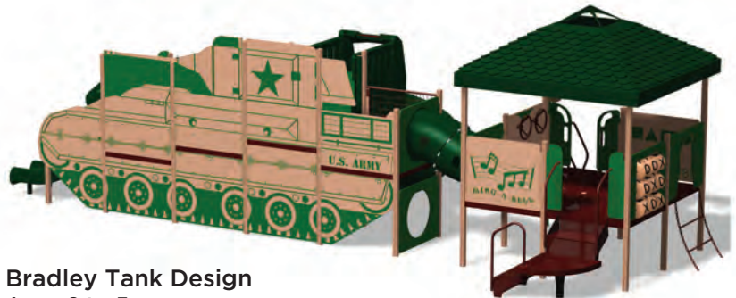
Bradley Tank Design Ages 2 to 5